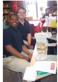
Financial and job skills practice at Vistas Taco Lunch

Strengthening Communities, Children and Families