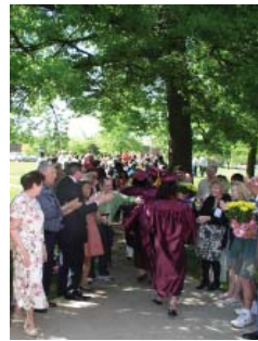
Graduating students surrounded by family, staff and supporters