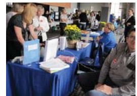
Attendees registering at the Community Resource Fair

Strengthening Communities, Children and Families