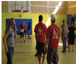
Farmers Insurance volunteers on the court with Marillac residents