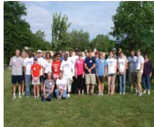
Day of Caring Volunteers