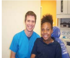
A student receives dental care from a generous donor