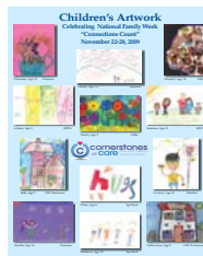
Children's Art Poster