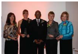
Outstanding Family Advocates