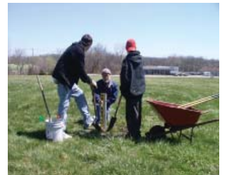
Boys in Work Program help staff install baskets for campus disc golf course

Strengthening Communities, Children and Families